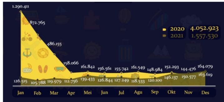
Figure 1. Statistics of International Tourist Visits 2020-2021

The government is trying to restore the tourism sector by encouraging domestic tourism to help ease the blow of Covid-19 [1]. There has been some increase in domestic tourism activity, partly due to the shifting effect of international travel restrictions. However, this is hampered as many countries face further waves of the virus. In addition, not all tourist destinations benefit, due to continued restrictions on movement within countries and changing demand patterns and behavior.